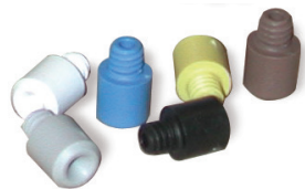
Metering Tips Part #NA0816A